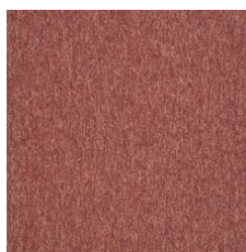
Schoolgirl 71615 LRV 7.6 | L* 33.04