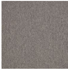
Pure Titanium 71595 LRV 10.2 | L* 38.18