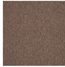
Coffee Break 71761