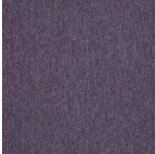
Plum Martini 71965