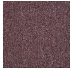
Rose Trellis 71830