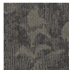
Edition 75585 LRV 12.1 | L* 41.39