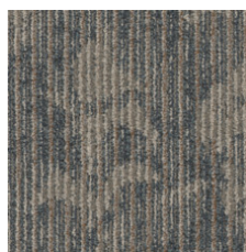
Essay 75429 LRV 18.2 | L* 49.76