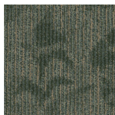
Folio 75305 LRV 11.3 | L* 40.02