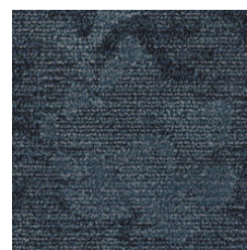
Anthem 75486 LRV 6.1 | L* 29.7