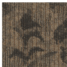
Symbolism 75770 LRV 12.3 | L* 41.64