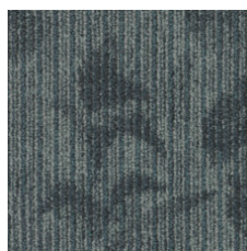
Repertoire 75325 LRV 11.9 | L* 41.02