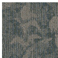
Allusion 75400 LRV 14.9 | L* 45.47