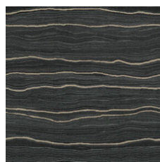
Colossal Bismut 20496 LRV 2.5 | L* 17.71