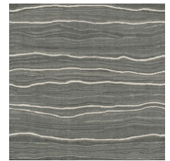
Forge Platinum 20518 LRV 11.1 | L* 39.75