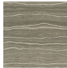
Element Platinu 20506 LRV 15.7 | L* 46.62