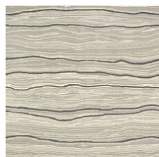
Carrara Silver 20100 LRV 48.8