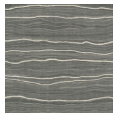
Forge Platinum 20518 LRV 11.1