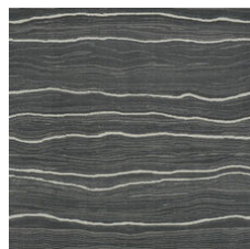
Slate Palladium 20595 LRV 5