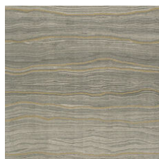
Alabaster Gold 20111 LRV 20.4