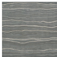
Talc Platinum 20535 LRV 17.6