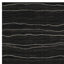
Onyx Silver 20505 LRV 1.6