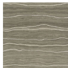
Element Platinum 20506 LRV 15.7