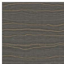
Cornerstone Cop 20555 LRV 7.8