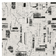
High Atlas 01100