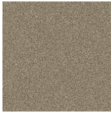
Work Out 00137