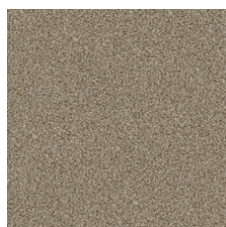
Work Out 00137