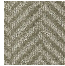
Brushed Nickel 03570 LRV 15.8 | L* 46.67