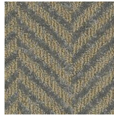
Mirrored 03525 LRV 12 | L* 41.2