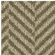
Camel Hair 03120 LRV 15.6 | L* 46.46