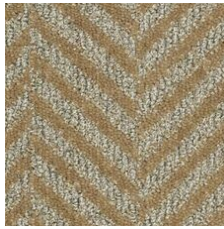
Gilded 03250 LRV 16.1 | L* 47.11