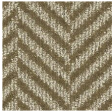
Camel Hair 03120 LRV 15.6 | L* 46.46