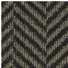
Truffle 03700 LRV 5.3 | L* 27.54