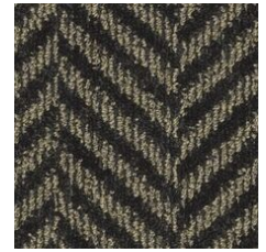
Truffle 03700 LRV 5.3 | L* 27.54