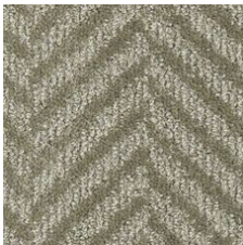
Brushed Nickel 03570 LRV 15.8 | L* 46.67