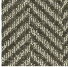
Mushroom 03750 LRV 11.4 | L* 40.3