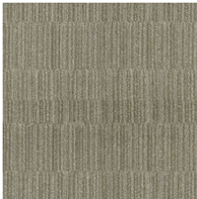
Brushed Nickel 03570