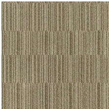
Camel Hair 03120