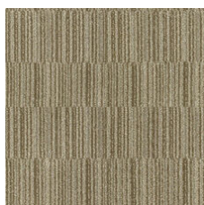
Camel Hair 03120