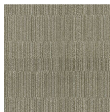
Brushed Nickel 03570