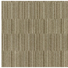
Camel Hair 03120