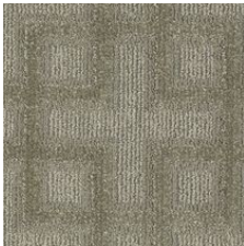
Brushed Nickel 03570