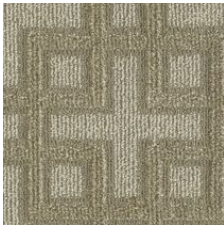
Camel Hair 03120