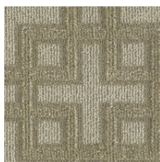
Camel Hair 03120