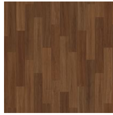
Ginger Oak 06630 V4 - Substantial Variation Weldrod 06140