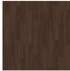
Cocoa Walnut 06760 V3 - Moderate Variation Weldrod 02026