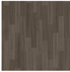
Liquorice Oak 06570 V4 - Substantial Variation Weldrod 09561