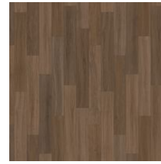
Nubuck Oak 06700 V4 - Substantial Variation Weldrod 05211