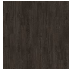
Sable Oak 06780 V3 - Moderate Variation Weldrod 0732D