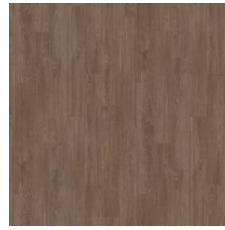
Buckskin Oak 06660 V3 - Moderate Variation Weldrod 02025