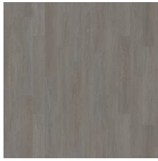
Palladium Oak 06515 V3 - Moderate Variation Weldrod 05211