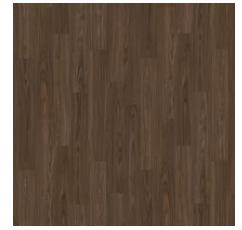
Clove Walnut 06710 V3 - Moderate Variation Weldrod 01823