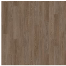
Cumin Oak 06720 V3 - Moderate Variation Weldrod 02020