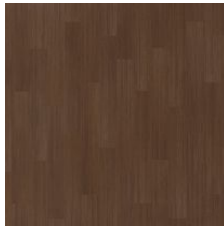
Cameroon Wenge 06730 V2 - Slight Variation Weldrod 12761