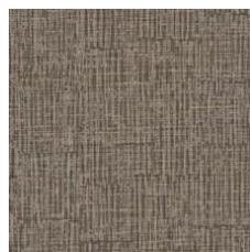
Hashi 08740 V2 - Slight Variation