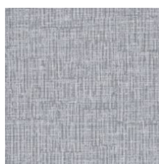
Mist 08510 V2 - Slight Variation