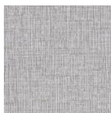
Lotus 08111 V2 - Slight Variation