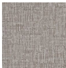
Cedar 08755 V2 - Slight Variation