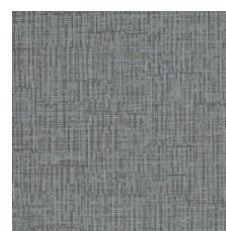
Pumice 08540 V2 - Slight Variation