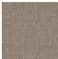
Bonsai 08705 V2 - Slight Variation