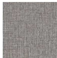
Brushwood 08765 V2 - Slight Variation