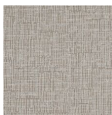
Path 08120 V2 - Slight Variation