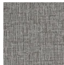
Alcove 08770 V2 - Slight Variation