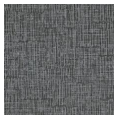
Midnight 08585 V2 - Slight Variation