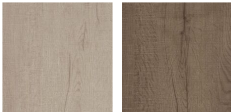
Balance 73755 V2 - Slight Variation Golden 73756 V3 - Moderate Variation

Shade and texture variation is inherent in all resilient products and can vary significantly from piece to piece. Samples should be used to assess color.