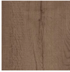
Golden 73756 V3 - Moderate Variation