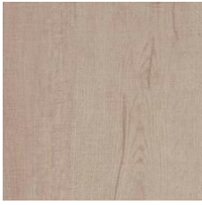
Balance 73755 V2 - Slight Variation