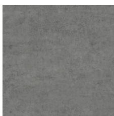
Elevate 77518 LRV 24.3 | L* 56.41 V2 - Slight Variation