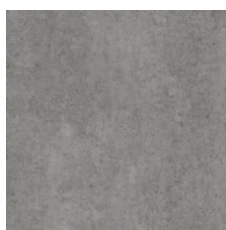
Chisel 77520 LRV 26.2 | L* 58.22 V2 - Slight Variation