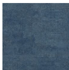
Azure 77436 LRV 13.8 | L* 43.98 V2 - Slight Variation