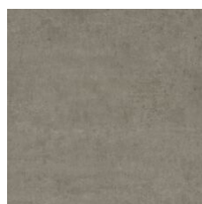
Relief 77111 LRV 27.6 | L* 59.55 V2 - Slight Variation