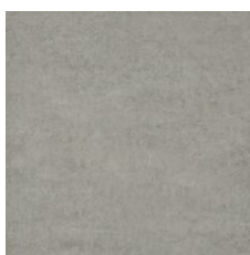
Origin 77114 LRV 39.4 | L* 69.03 V2 - Slight Variation