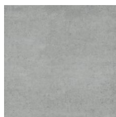
Threshold 77515 LRV 45.5 | L* 73.20 V2 - Slight Variation