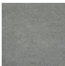
Onset 77525 LRV 36.2 | L* 66.70 V2 - Slight Variation