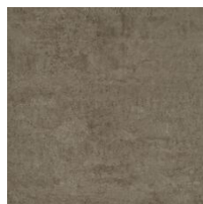
Bisque 77620 LRV 23.2 | L* 55.31 V2 - Slight Variation