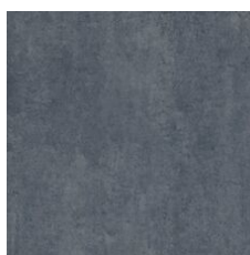
Beryl 77429 LRV 13.1 | L* 42.97 V2 - Slight Variation