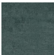
Patina 77405 LRV 14.4 | L* 44.79 V2 - Slight Variation