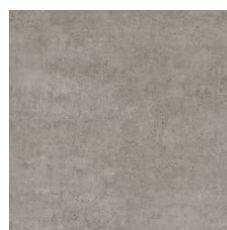
Base 77504 LRV 29.7 | L* 61.40 V2 - Slight Variation