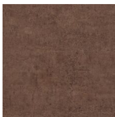
Terra Cotta 77715 LRV 14.9 | L* 45.43 V2 - Slight Variation