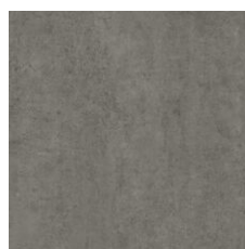
Foundation 77530 LRV 15.2 | L* 45.93 V2 - Slight Variation