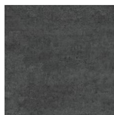
Granite 77585 LRV 12.4 | L* 41.83 V2 - Slight Variation