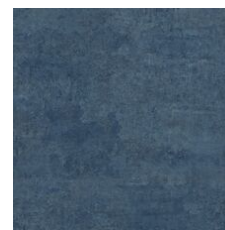
Azure 77436 LRV 13.8 | L* 43.98 V2 - Slight Variation