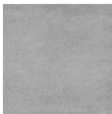
Threshold 77515 LRV 45.5 | L* 73.20 V2 - Slight Variation