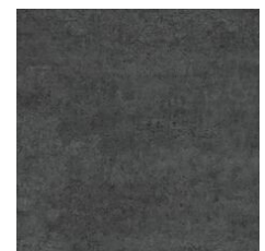
Granite 77585 LRV 12.4 | L* 41.83 V2 - Slight Variation