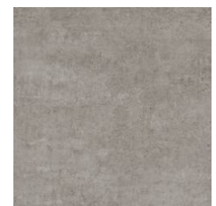
Base 77504 LRV 29.7 | L* 61.40 V2 - Slight Variation