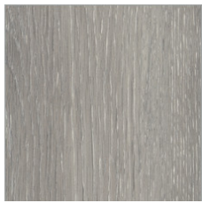
Distinct 38115 V3 - Moderate Variation