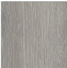
Distinct 38115 V3 - Moderate Variation

Visit shawcontract.com/testing for more information.