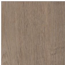
Composition 38720 V2 - Slight Variation