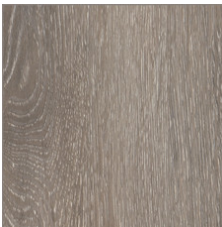
Inherent 38700 V3 - Moderate Variation