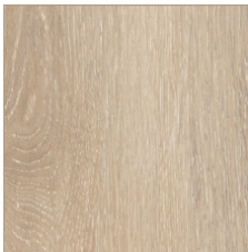
Theory 38140 V2 - Slight Variation