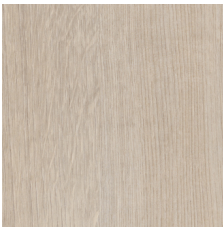
Initiate 38130 V2 - Slight Variation