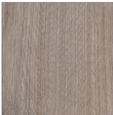
Prelude 38710 V2 - Slight Variation