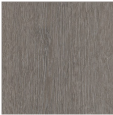
Overture 38760 V2 - Slight Variation