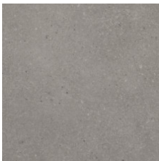
Change 86520 LRV 24.8