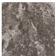
Canyon 15180 LRV 14.8 | L* 45.38