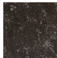
Slope 15518 LRV 7 | L* 31.9