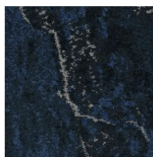
Coast 15456 LRV 3.2 | L* 20.88