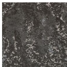
Ridge 15580 LRV 10.2 | L* 38.15