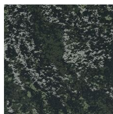
Moss 15326 LRV 8.2 | L* 34.45