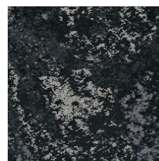
Vast 15505 LRV 2.7 | L* 19.01