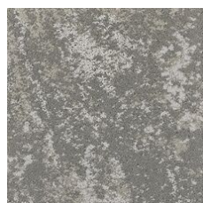
Dune 15105 LRV 22.8 | L* 54.85