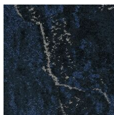
Coast 15456 LRV 3.2 | L* 20.88