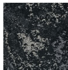
Vast 15505 LRV 2.7 | L* 19.01