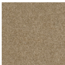
Nature Refresh 00720