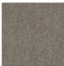
Graceful Breeze 00592