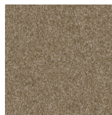
Mocha Froth 00702