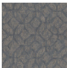
First Impressio 77402 LRV 9.2 | L* 36.4