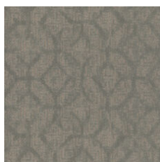
Self Reflection 77484 LRV 10.1 | L* 38