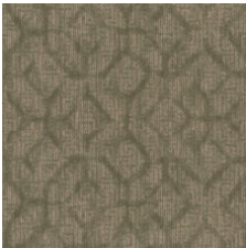
Enriched Wisdom 77330 LRV 8.8 | L* 35.57