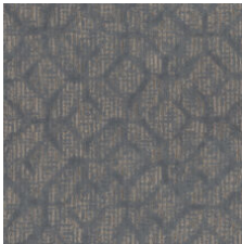
First Impressio 77402 LRV 9.2 | L* 36.4