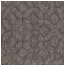
Refined Eleganc 77585 LRV 14.7 | L* 45.29