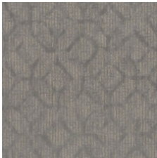
Major Milestone 77515 LRV 15.7 | L* 46.6