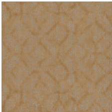
Humble Beginnin 77155 LRV 14.4 | L* 44.84