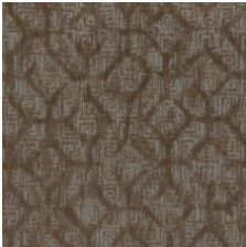
Express Gratitu 77740 LRV 13.9 | L* 44.09