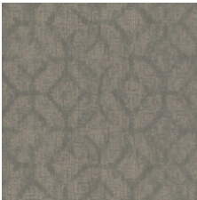
Self Reflection 77484 LRV 10.1 | L* 38