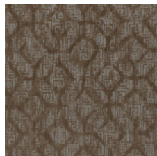
Express Gratitu 77740 LRV 13.9 | L* 44.09