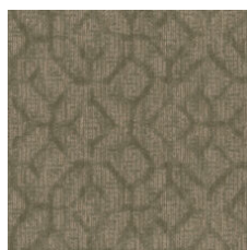
Enriched Wisdom 77330 LRV 8.8 | L* 35.57