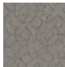
Major Milestone 77515 LRV 15.7 | L* 46.6