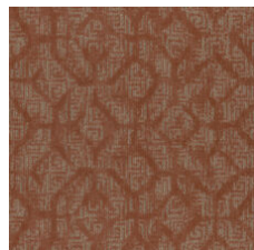
Adventurous Spi 77665 LRV 12.2 | L* 41.56