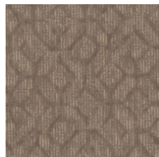
Warm Intentions 77761 LRV 18.6 | L* 50.25