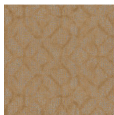
Humble Beginninn 77155 LRV 14.4 | L* 44.84