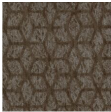
Express Gratitude 77740