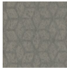
Self Reflection 77484