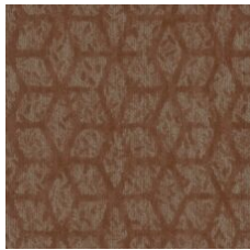
Adventurous Spi 77665