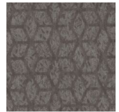
Refined Eleganc 77585