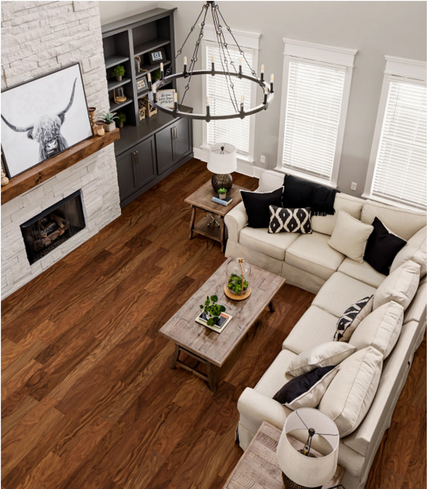
1140 Natural Short Leaf Acacia