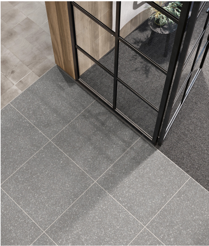
520 Pure Gray