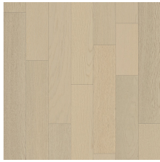
Gallant Oak 01007