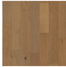
Sophisticated Oak 02012