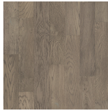
Cultivated Oak 05014