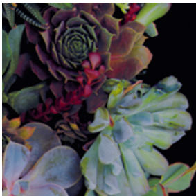
87335 Verdant 5223D serge yarn color