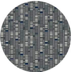
89535 Flow 5365D serge yarn color