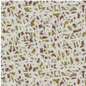
88100 Foundation 910 hidden edge color