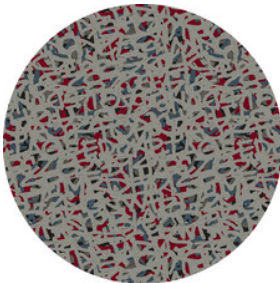
88580 Vibe 5500D serge yarn color