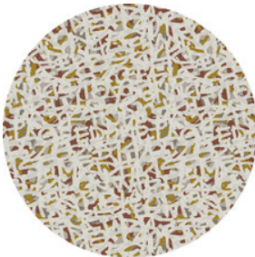
88100 Foundation 6046 serge yarn color