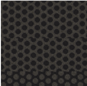
76535 Transform 995 hidden edge color