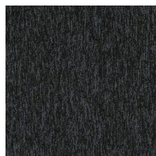
Black 83505 LRV 3.6 | L* 22.12