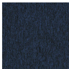
Admiral 83496 LRV 4 | L* 23.75