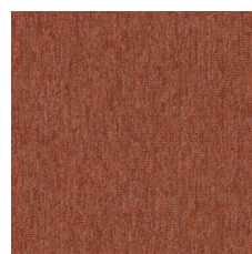
Coral 83866 LRV 11.5 | L* 40.45