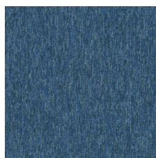
Jade 83406 LRV 10 | L* 37.83