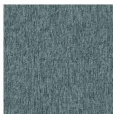
Mint 83327 LRV 15.9 | L* 46.86