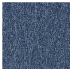
Azure 83486 LRV 9.8 | L* 37.54