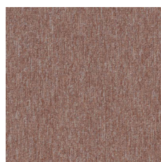
Blush 83675 LRV 18.3 | L* 49.9