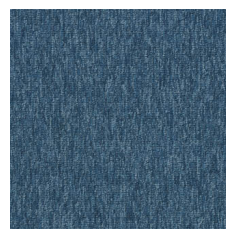
Cadet 83440 LRV 11.3 | L* 40.15