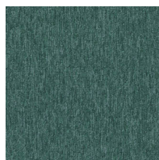
Seaweed 83335 LRV 10.3 | L* 38.29