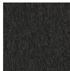
Flint 83549 LRV 3.6 | L* 22.28