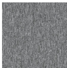
Ash 83535 LRV 18.2 | L* 49.71