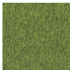
Spring 83326 LRV 17.7 | L* 49.08