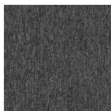
Pebble 83558 LRV 7.7 | L* 33.37