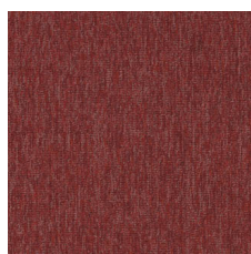
Crimson 83857 LRV 7.7 | L* 33.24