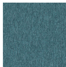
Lagoon 83419 LRV 13 | L* 42.8