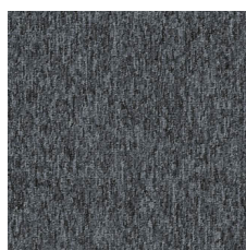
Smoke 83581 LRV 9.4 | L* 36.76