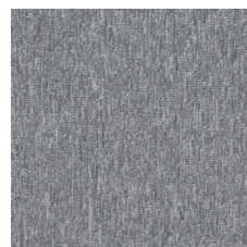
Ice 83536 LRV 20.9 | L* 52.84